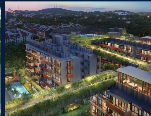
2 - Bedroom Premium